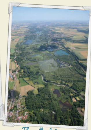
The valley between Picquigny and Amiens