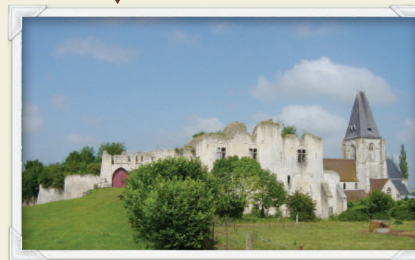
17 The remains of Picquigny Castle and Collegiate