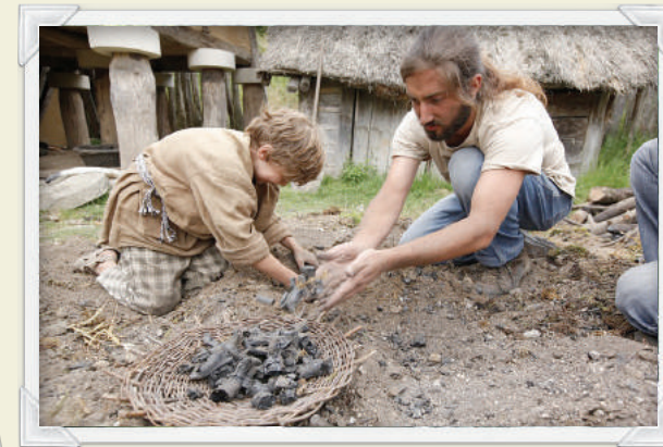
12 Samara, a park combining archaeology, prehistoric history and nature