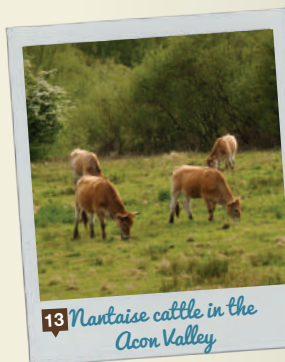
13 Nantaise cattle in the Acon Valley