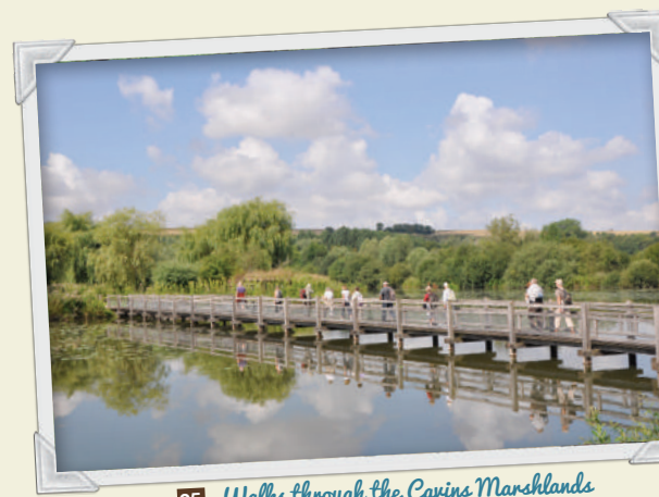
25 Walks through the Cavins Marshlands