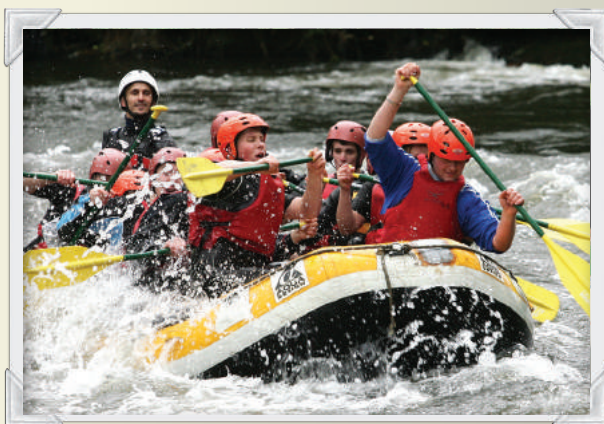
18 River canoeing and rafting at Picquigny