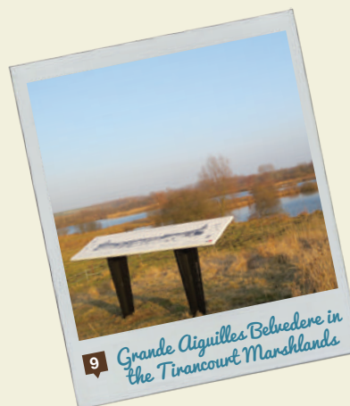
9 Grande Aiguilles Belvedere in the Tivancourt Marshlands