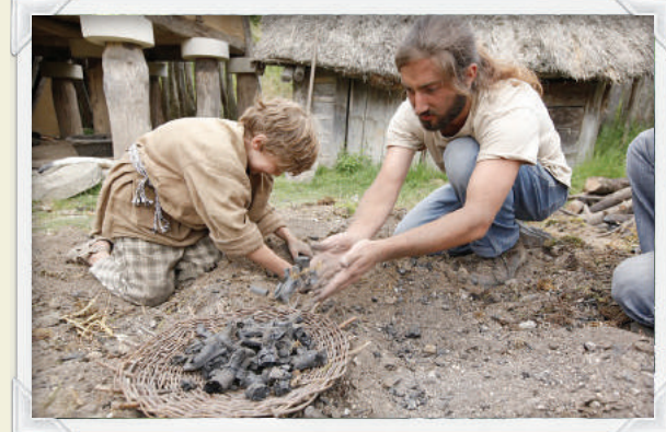
12 Samara, a park combing archaeology, prehistoric history and nature