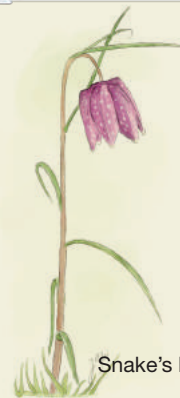
Snake's head fritillary