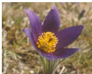
The Pasque flower is spectacular in March and April.

In the spring, the grass is covered with a carpet of flowers characteristic of the site: the yellow Horseshoe Vetch, the blue Globularia, and the purple Pasque flower. Six varieties of wild orchids can be counted here such as, the Fragrant Orchid or the Lady Orchid.