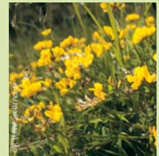
In May the chalk-banks are adorned with the bright yellow flowers of the Horseshoe Vetch .

Abandoned since the 1960’s, grazing was re-established in 2003 with the introduction of a flock of sheep to the site. Since then, each summer, about 20 sheep actively participate in the clearing and maintenance of the chalk-banks. This completes the work carried out at the opening of the site (clearing and wood cutting) by the Conservatoire d’Espaces Naturels de Picardie who manage the site. It should be noted that there was no need for much clearance work because of the steep slopes and the work rabbits had already carried out.